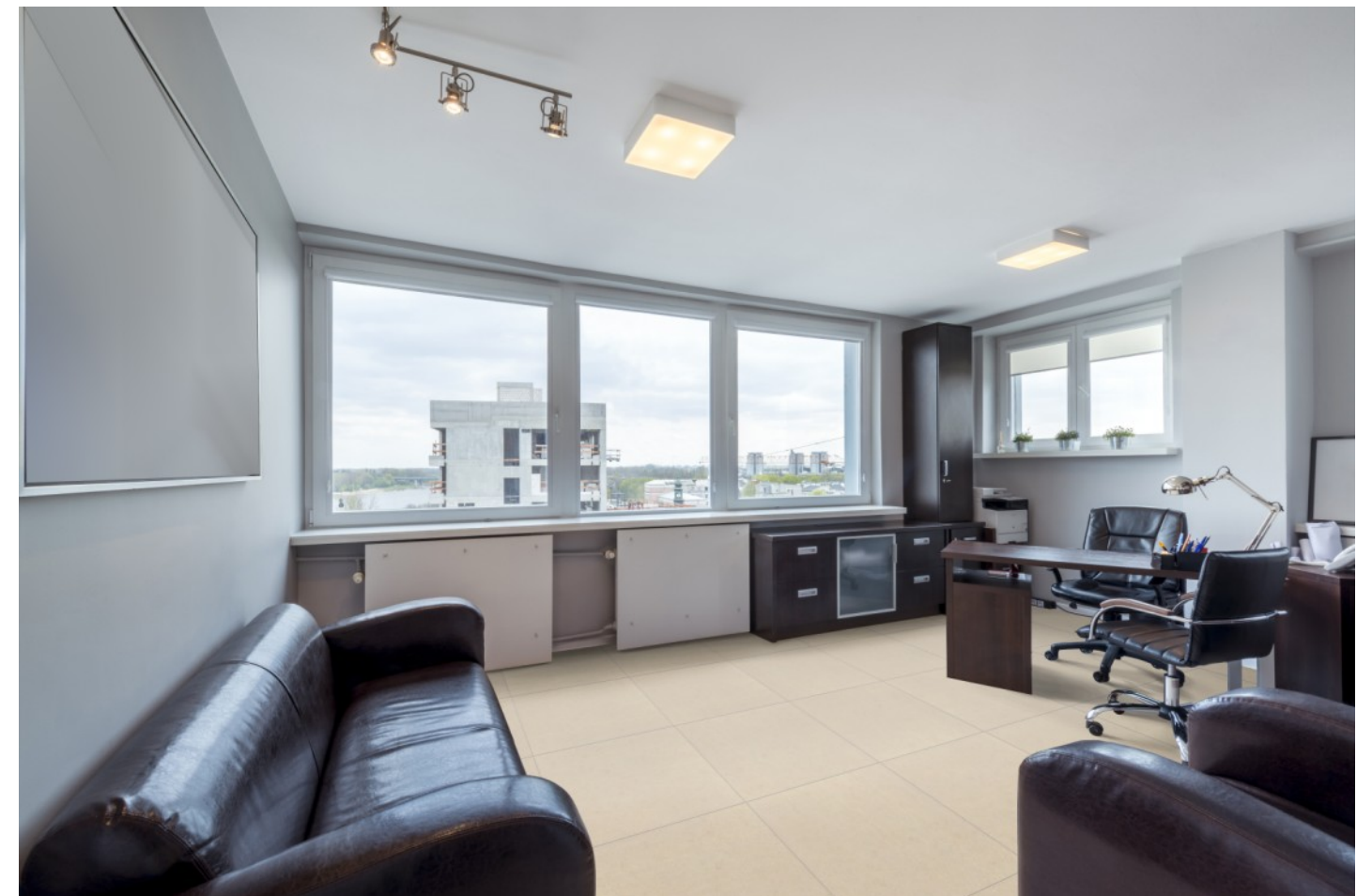
Italian ink-jet design Full Colour Body Porcelain Floor Tiles