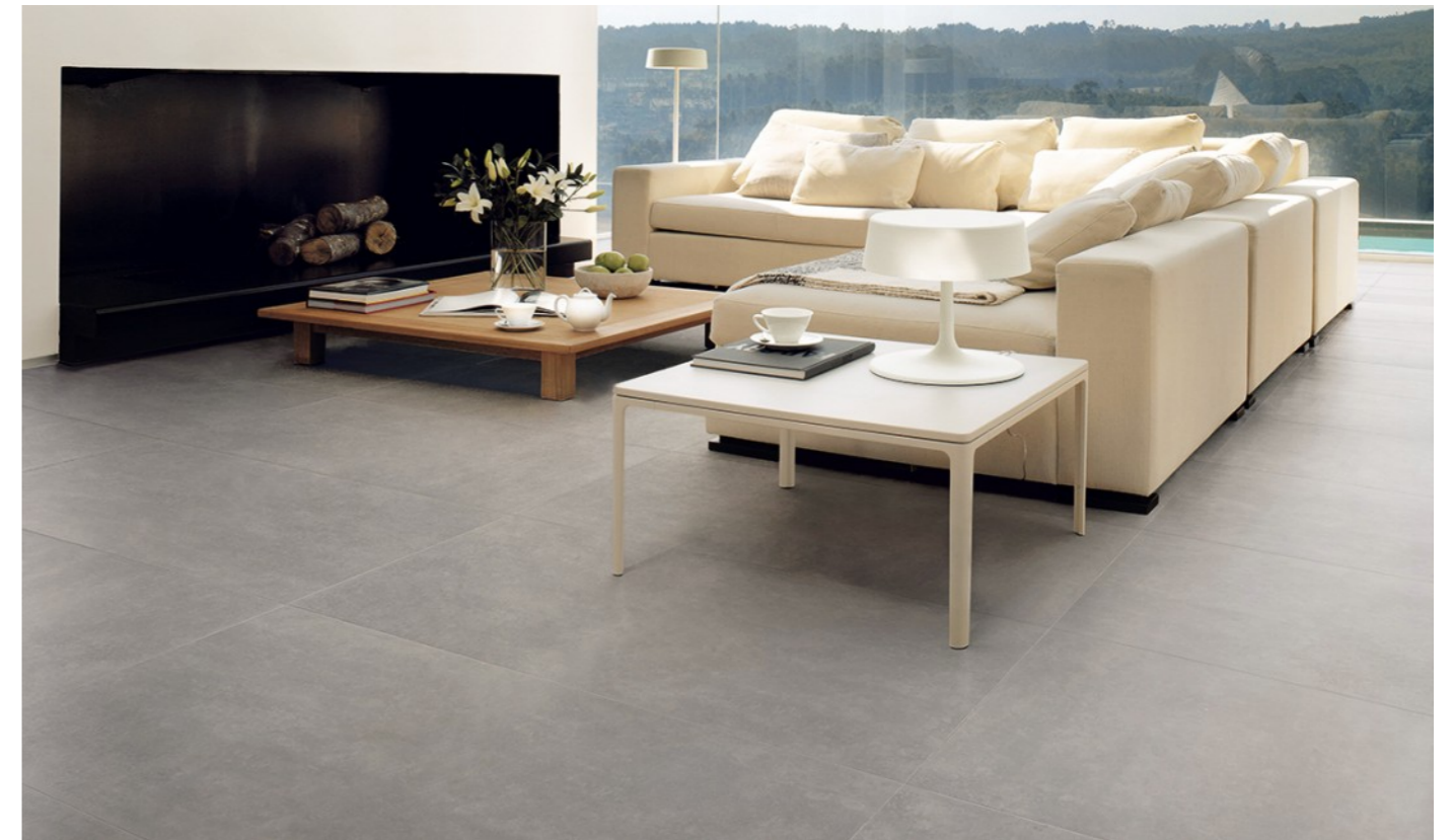
Italian ink-jet design Gres Porcelain Floor Tiles