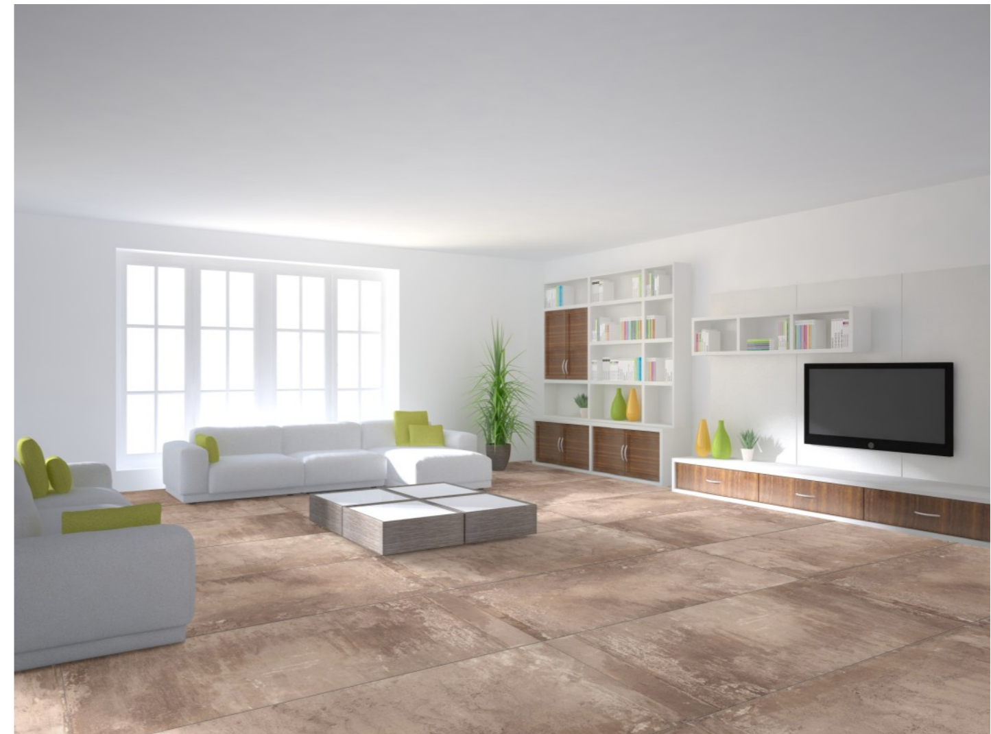
Italian ink-jet design Gres Porcelain floor & wall tiles