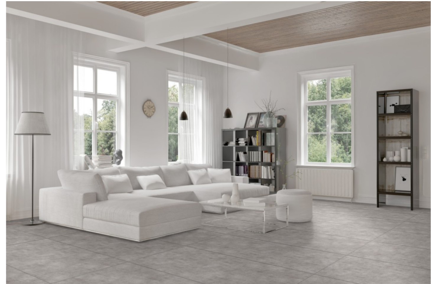
Italian ink-jet design Gres Porcelain floor & wall tiles