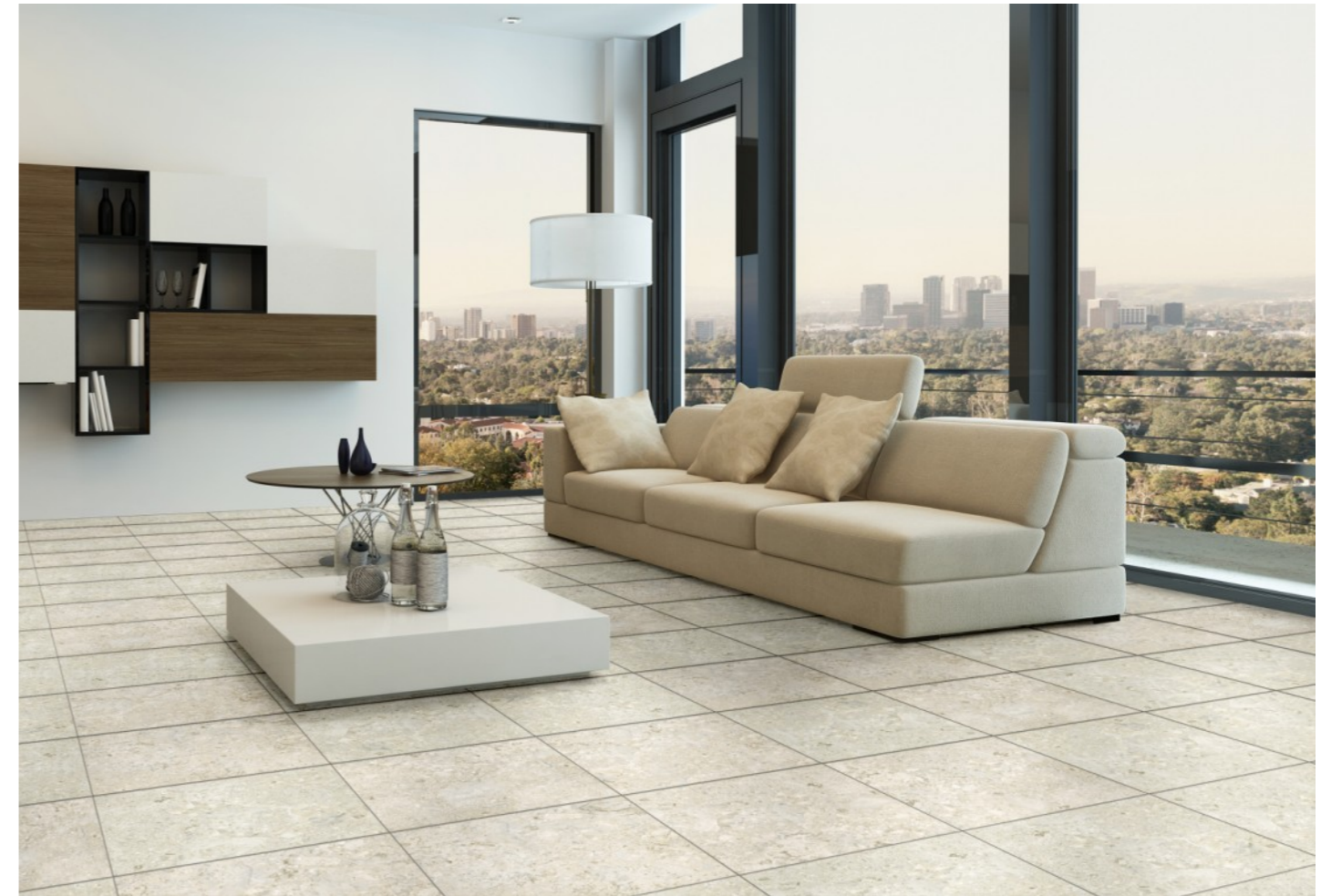
Italian ink-jet design Gres Porcelain floor & wall tiles