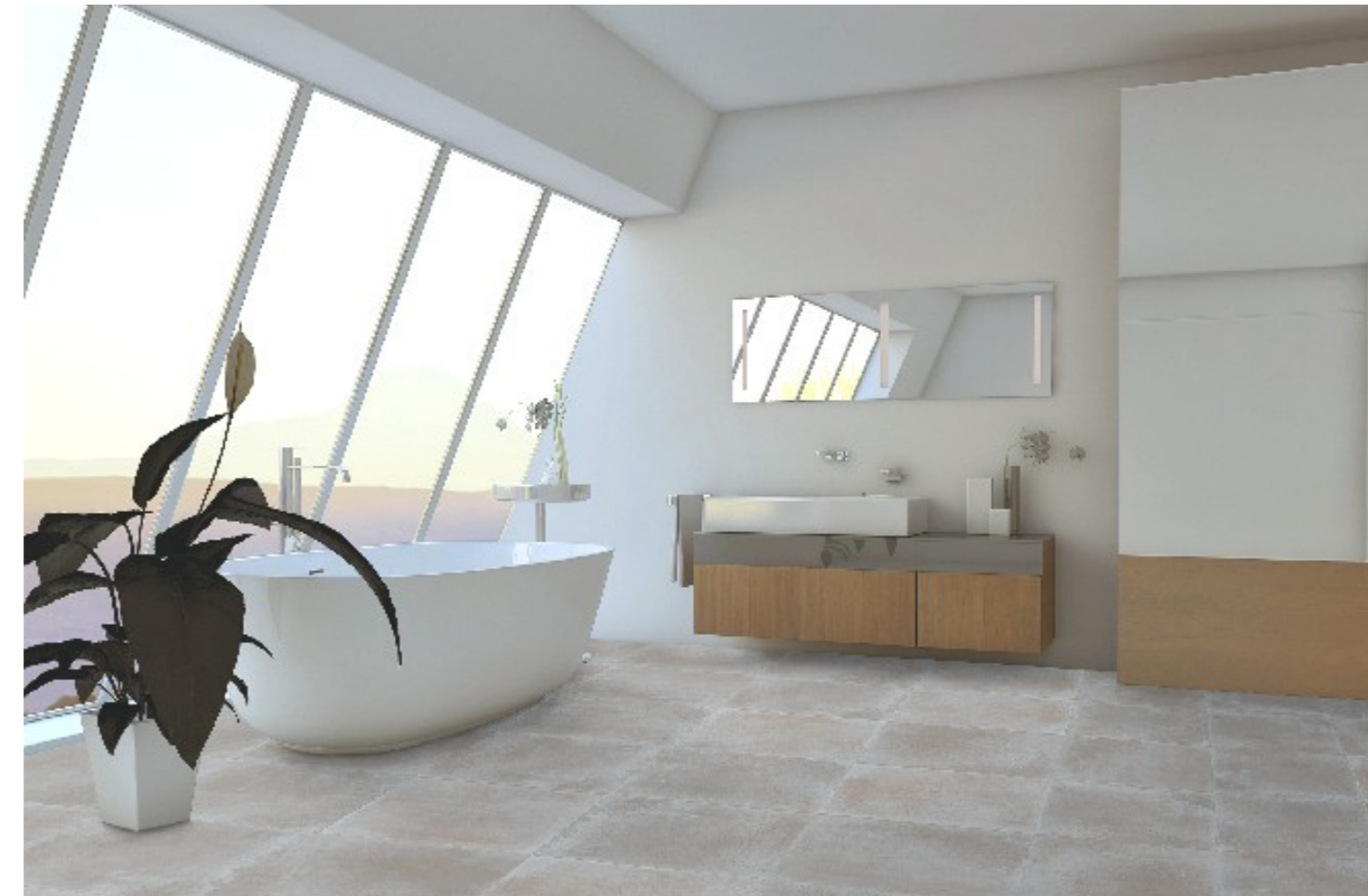
Italian ink-jet design Gres Porcelain floor tiles