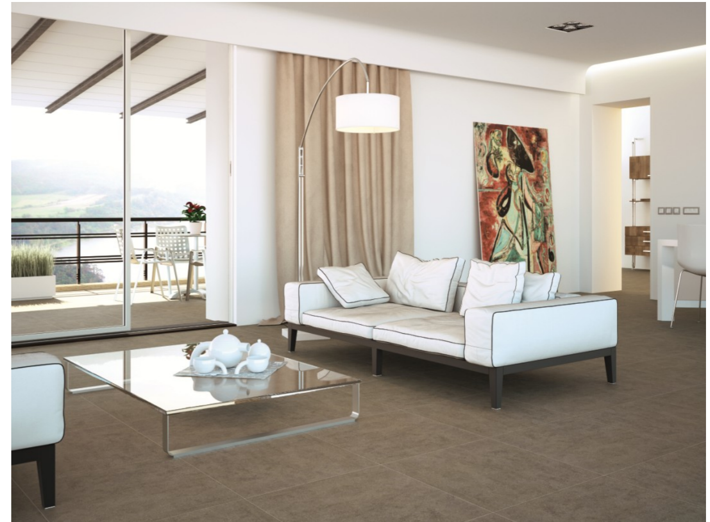
Italian ink-jet design Porcelain floor & wall tiles